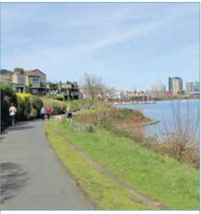
The Willamette Greenway trail was made for runners, walkers, rollers and strollers of all ages and abilities.