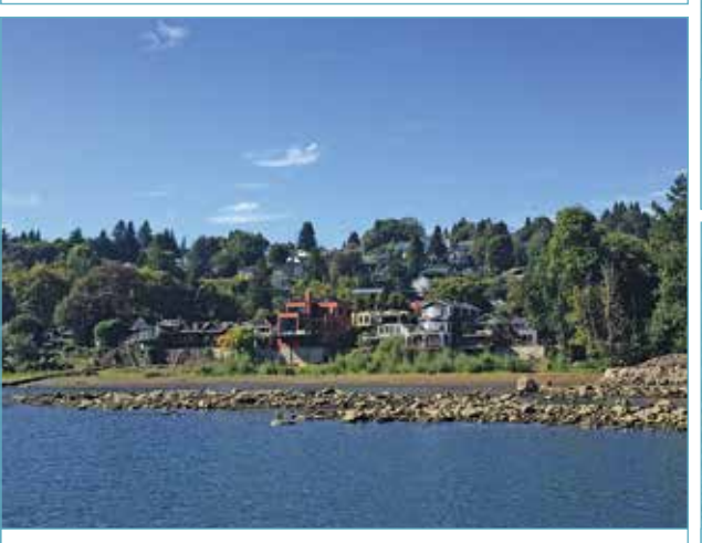
Single-family homes next to the river's edge are common in the South Reach.