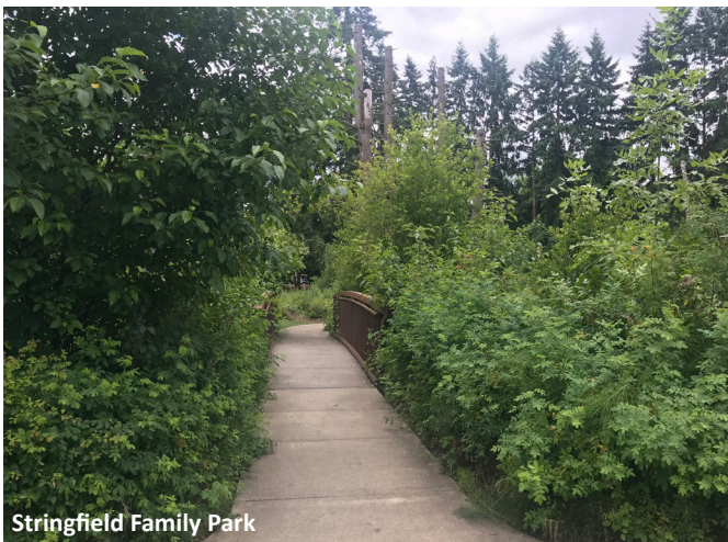
Stringfield Family Park