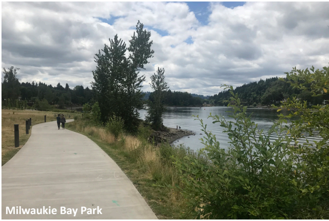
Milwaukie Bay Park