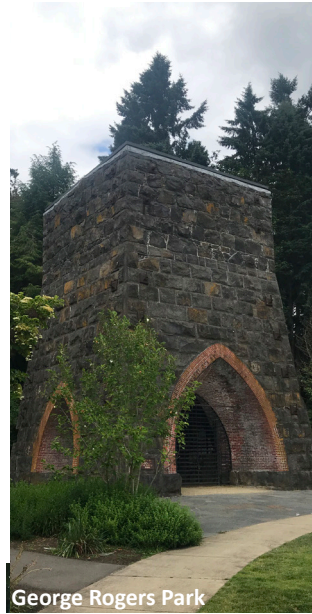
George Rogers Park

Privately owned River View Cemetery is a non-profit association founded in 1882. The cemetery has become a part of Portland's bicycling community by allowing cyclists to ride through to avoid the dangerous roadways of Macadam and Taylors Ferry. The issue of allowing cyclists is an ongoing topic of discussion. River View sold 146 acres to create Portland's River View Natural Area to help protect natural habitat, headwater streams, and create a continuous wildlife migration corridor in the West Hills. The Cemetery has been home to two bald eagles for nearly 20 years.