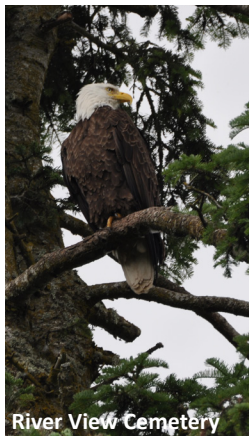
River View Cemetery