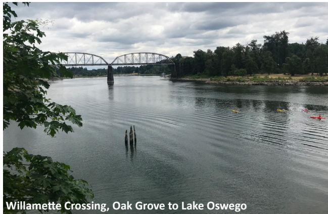
Willamette Crossing, Oak Grove to Lake Oswego