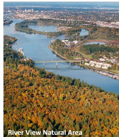
River View Natural Area