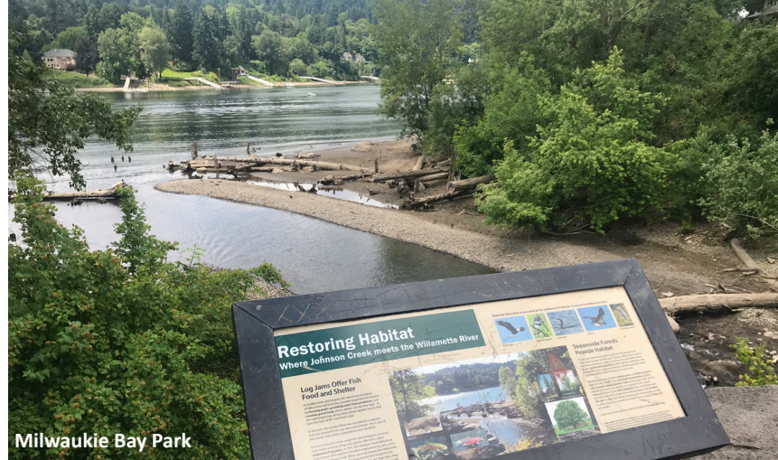
Milwaukie Bay Park

This park's 8.5 acres are nestled between the Willamette River to the west, Kellogg Creek to the south and Johnson Creek to the north. It opened in May 2015 with funding from Oregon Department of Fish and Wildlife, Oregon Parks and Recreation Department, Oregon Marine Board, Clackamas County, Kellogg Good Neighbor Committee and the City of Milwaukie.